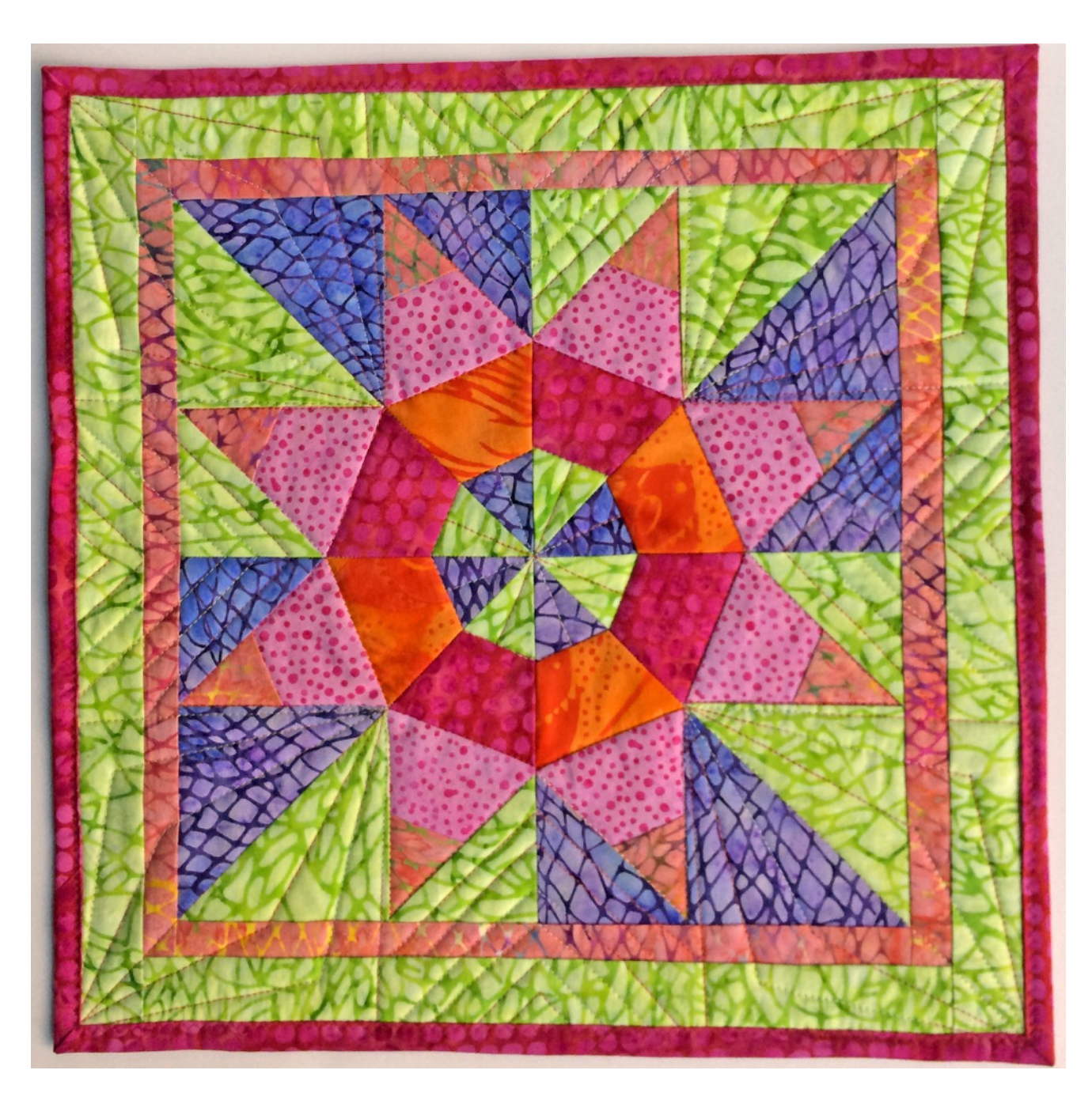
Mini Quilt measures 12 1/2" x 12 1/2".

... where \ dreamers \ become \ quilters